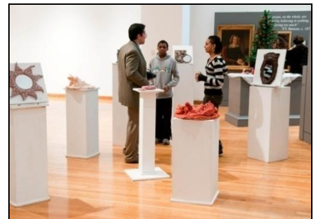
Photos: Top row, NS sculpture students show off their creations. Below left, holiday ornaments for sale. Below right, student artwork on display at the museum.