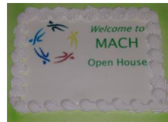
Above, guests enjoyed cake along with the numerous demonstrations at the MACH Open House. It is estimated that over one-hundred people attended each of the two Open House & Registration sessions.